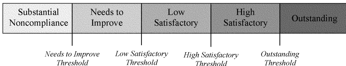
Figure 1: Illustration of thresholds and performance ranges

• The “Outstanding” performance range would be set at or above the “Outstanding” threshold level.